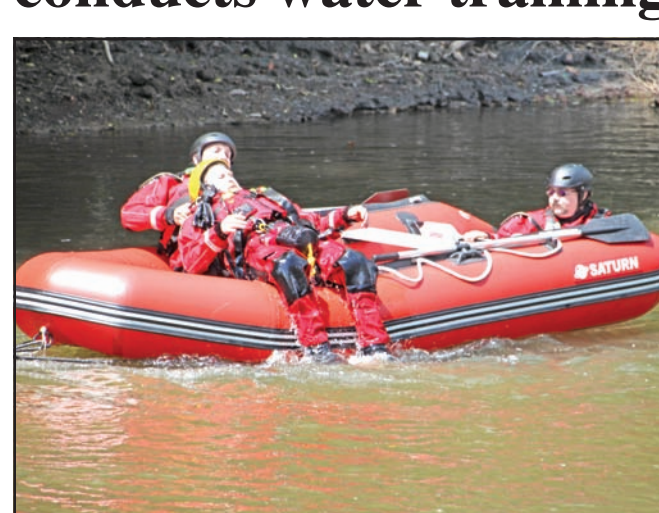
The Union County Fire Department routinely holds training exercises for its various departments. Here, the firefighters are training on pulling a "patient" out of swift moving water.

By Lily Avery North Georgia News Staff Writer