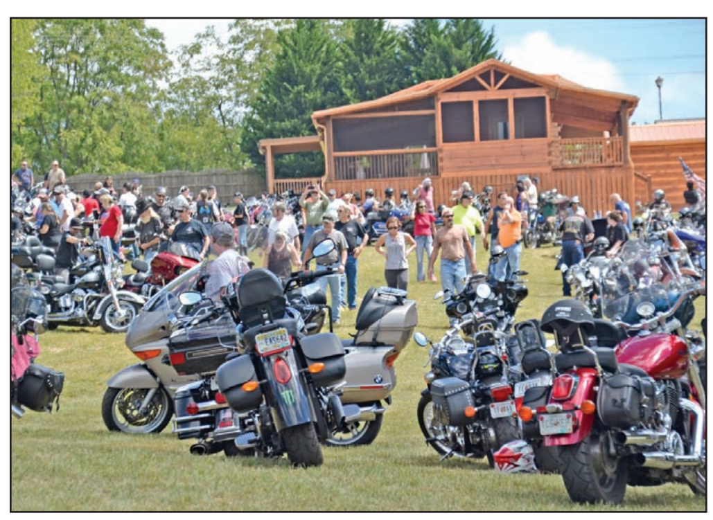
Around 900 motorcycles, including first responders and veterans from around the region, took part in the 'Ride to Remember,' which began in Athens and ended in Blairsville on Sunday,

In conjunction with honoring the nearly 50,000